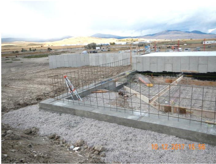
Figure 1 – Headworks Building – Upper Footings