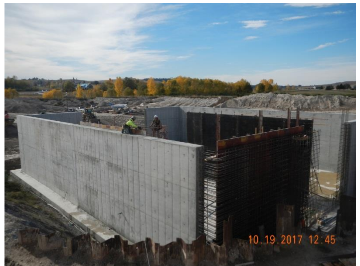
Figure 4 – SBR Tanks – East Wall Done, North Wall Form