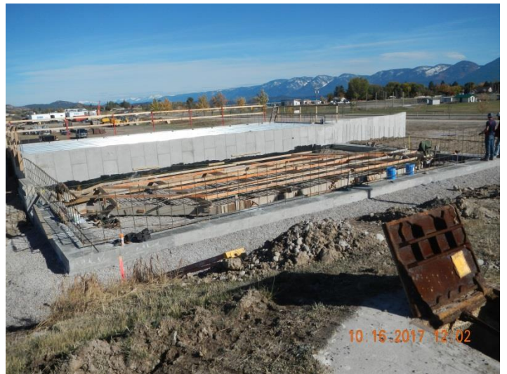
Figure 2 –Headworks Building – Flow Channel Forming