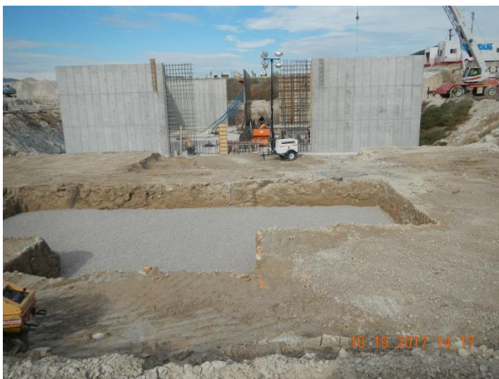
Figure 5 – South End of SBR; UV Building Lower Slab Preparation