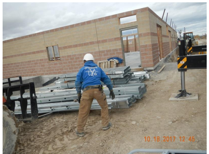
Figure 6 – Control Building Masonry - Complete